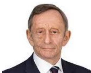
Lord Chief Justice Malcolm Bishop Tonga

Lord Chief Justice, President of the Land Court and Court of Appeal of the Kingdom of Tonga. Lord Chief Justice Bishop KC was appointed Lord Chief Justice of the Kingdom of Tonga on 1 September 2024.