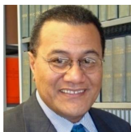
Chief Justice Satiu Simativa Perese Samoa

Chief Justice Satiu Perese was appointed Chief Justice in June 2020. He is a Te Herenga Waka, Victoria University of Wellington Law School alumni and was admitted to the New Zealand bar in 1990. He obtained his Master of Laws from Columbia University Law School, New York. He was admitted to the bar in Samoa in 1999.