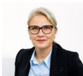
Chief Justice Helen Winkelmann Tokelau

The Rt Hon Dame Helen Winkelmann was sworn in as New Zealand's 13th Chief Justice on 14 March 2019. As the Chief Justice of New Zealand, the Rt Hon Dame Helen Winkelmann is automatically Chief Justice of Tokelau. She was appointed as a High Court Judge in 2004, followed by Chief High Court Judge in 2010. She was appointed to the Court of Appeal in 2015, before being appointed to the Supreme Court in 2018.