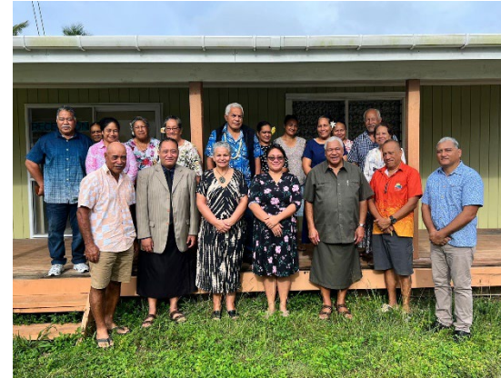
While the training was designed for Land Commissioners, Civil and Criminal Commissioners and Justices of the Peace sat in on the sessions.

The purpose of the visit was to deliver bespoke training for Land Commissioners, support the delivery of access to justice initiatives, and help devise a training plan for Niue’s justice sector. The week began with group interviews with Commissioners, Justices of the Peace, court staff, advocates, and lawyers to help inform the development of a three-year training plan for Niue justice sector, before moving into three days of targeted training for Land Commissioners.